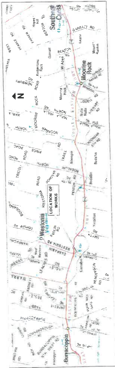
LOCALITY PLAN NOT TO SCALE