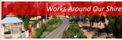
Works Around Our Shire