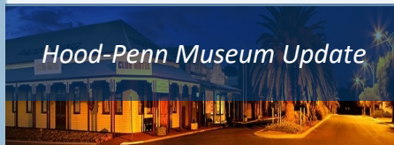
Hood-Penn Museum Update